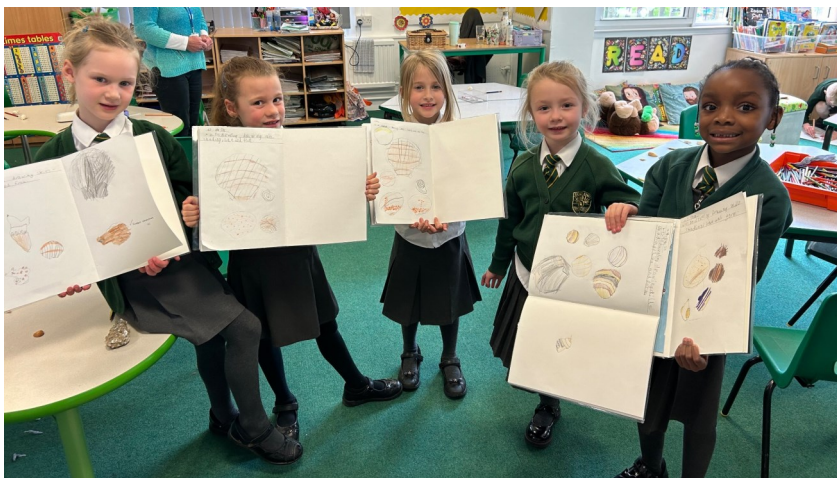
Year 1 and 2 did some beautiful observational drawing of shells this week. They practised their skills of shading, line and form! (left)